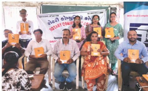
Distribution of Note books to the needy students of the Navjeevan School.