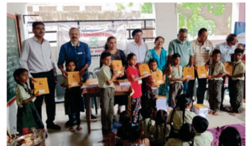
Distribution of Note books to the needy students of the prathamik School at Vagusana Village, Bharuch District.