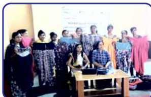
Women Empowerment Project