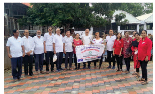
Gaumatapujan at Panjarapol, Near JB Modi Park, Saktinath.