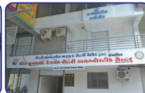
P.D. Shroff Rotary Diagnostic Center