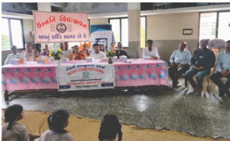
Distribution of Note books to the needy students of the Unnati Vidyalaya.