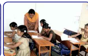
Hum Honge Kamyab - Literacy