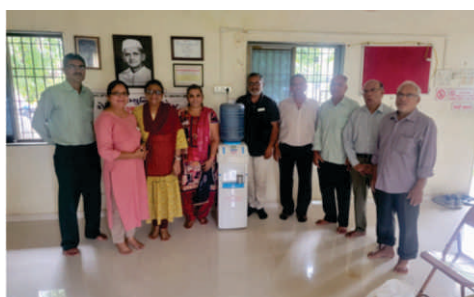
Inogration of new water cooler at RCC Library, Zadeshwar which is donated by Rotary club of Bharuch.