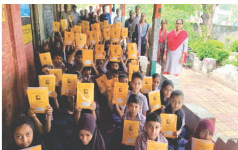
Distribution of Note books to the needy students of the prathamik School at Luvara Village, Bharuch District