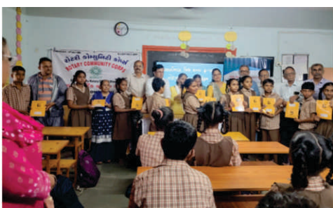
Distribution of Note books to the needy students of the Gayatri Nagar School, Near Mukti Nagar, Saktinath.