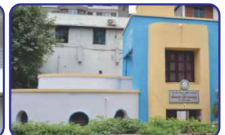
Pay & Use Toilet Blocks