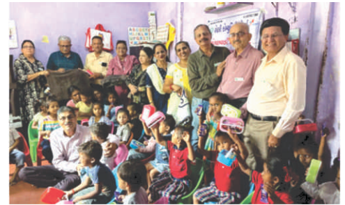
Distribution of Lunch Box & Mat to the students of the Anganvadi near Bhidbhanjan Hanuman Temple .