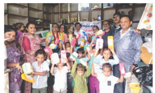
Distribution of Lunch box, Pencil, eraser & Sharpner with the box needy students of the Indira Nagar Anganvadi, Falshruti Nagar.