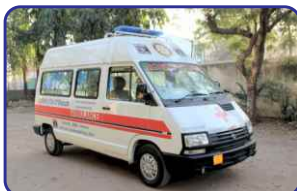
Ambulance & Morgue Vehicle