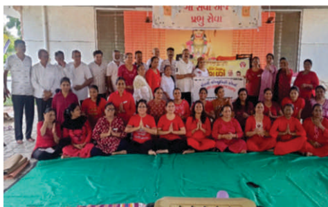
Arrange the yoga and Meditation session on the occasion of the International Yoga day at Panjara pol.