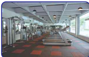
M. I. Patel Rotary Youth Center