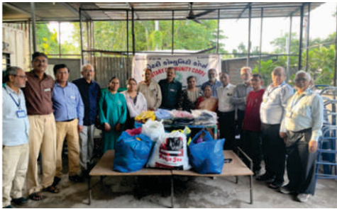
Distribution of Clothes for needy people of the interior village at Seva Yagna Samiti, Civil Hospital.