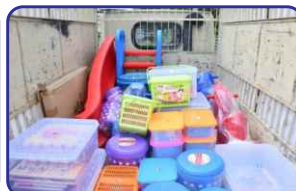
Mobile Toy Library - Ramakdu